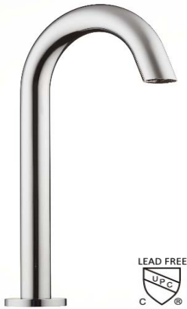
Faucet with Single Line Water Supply