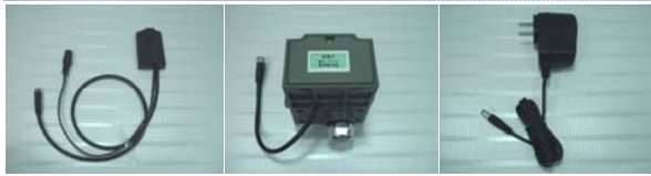
362AC-B2 Sensor Unit